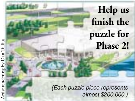
Artist rendering by Dan Tullius

While the ‘dead things’ keep piling up at our warehouse, Phase 2 of the museum building is now underway! Before you know it, there’ll be pipes and wires sticking out of the ground, as underground utilities go in on the property near the Cincinnati Airport!