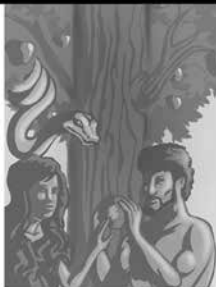
“The First Adam” 1 Corinthians 15:45