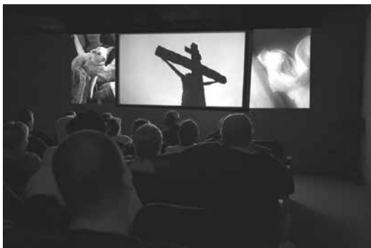
The Last Adam theater in the Creation Museum.

which is why Jesus stepped into history to become flesh 2,000 years ago.