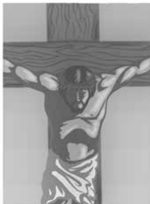
Jesus Christ “The Last Adam” 1 Corinthians 15:45

For as in Adam all die, even so in Christ shall all be made alive.